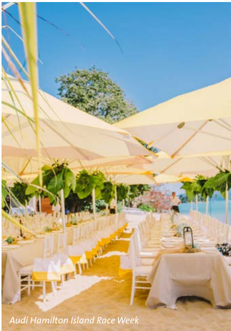
Audi Hamilton Island Race Week

Airlie Beach is located on the coast of Queensland and is a 30-minute drive from Proserpine airport or a 60-minute boat trip from Hamilton Island Marina. Airlie Beach's Abell Pint Marina, which has recently undergone a refurbishment, includes a dedicated heli taxi, new restaurants and an outdoor deck at Sorrento Restaurant & Bar that is available for functions. The town has a number of accommodation options available including luxury hotel, Peppers Airlie Beach.