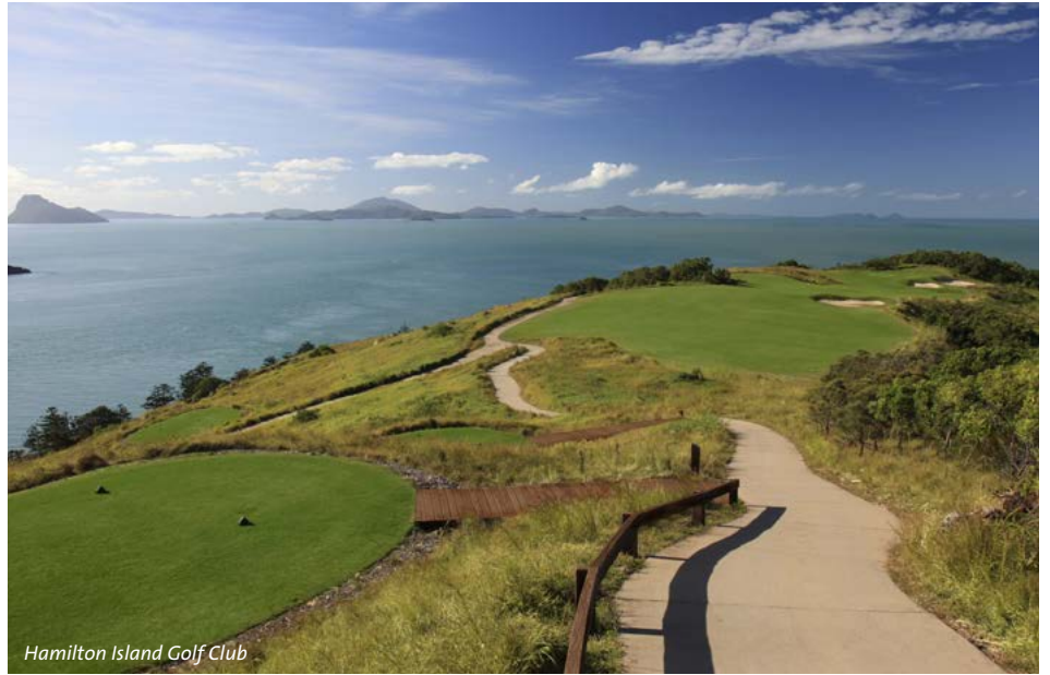
Hamilton Island Golf Club

Day Dream Island Resort and Spa has one of the world's largest man-made living coral reef lagoons. Living Reef Lagoon is home to 83 types of coral and 140 species of marine life, including barramundi, stingrays and sharks.